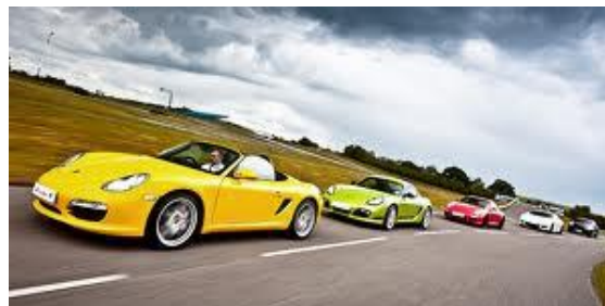
The Porsche Driving Experience*

* Source of image: http://www.porsche.com/silverstone/en/experience/porschedrivingexperience/