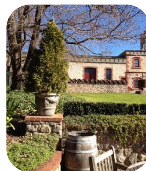
Yalumba cellar door, Barossa Valley, Australia

This paper draws on consumer and trade research carried out by Wine Intelligence and Intellima in Australia – a country where wine tourism is comparatively well developed. It also considers examples of visitor facilities in other sectors, and draws upon consumer trends that apply not just to wine but the entire world of commerce and communication.